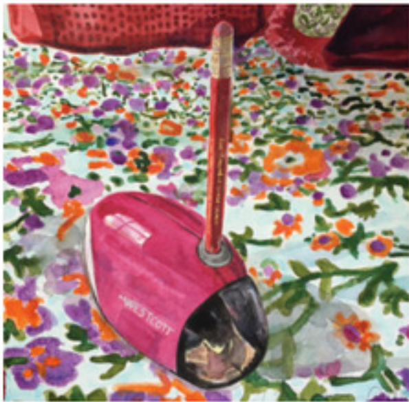
Pencil Sharpener, 2018

In most of these paintings, my mother's things are depicted in my house. In setting the scene for this piece, I just had to use the signature red Kentler pencil!