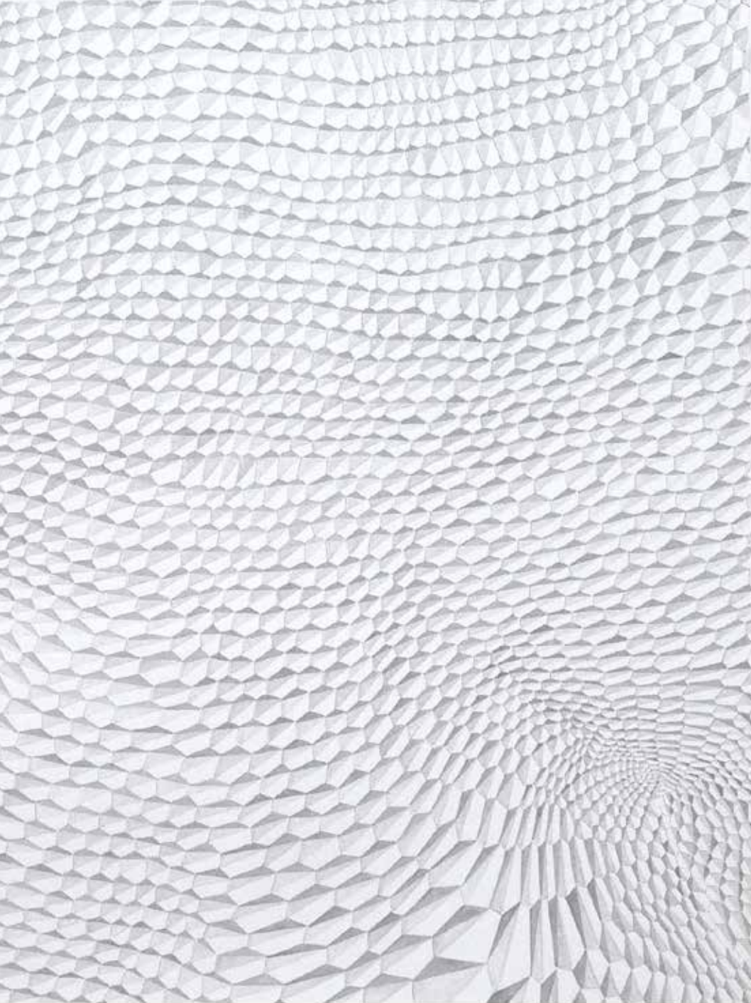
ABOVE: Grid La Penne 3 , (detail) 2012, 22" x 30", pencil and acrylic on paper.